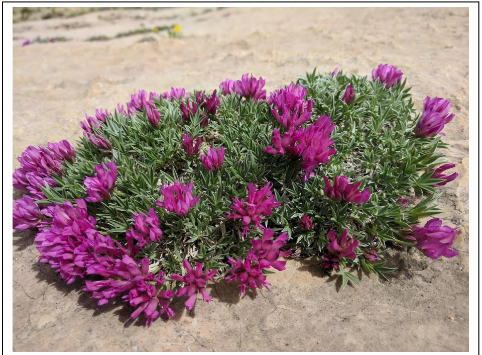
Above: "Laramie Hills clover"