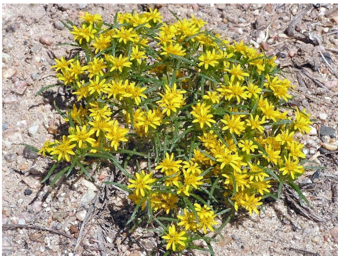
Pectis angustifolia , Goshen County

Pectis angustifolia , Lemonscent, is an annual to 8 inches tall and wide with much branched stems and a lemon scent. The leaves are opposite, narrow, and to 2 inches long. The flowers are in the typical Composite head with yellow ray flowers surrounding a central cluster of yellow disk flowers, the heads to 0.5 inch across and clustered at the stem tips. They appear in August and September. The plants occur naturally in dry sandy or gravelly areas of the plains. They prefer full sun and a dryish, well drained soil. They can be grown from seed which is commercially available.