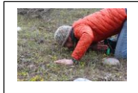
Above: The best position for admiring Utah buttercup.

Wyoming Native Plant Society is a non-profit organization established in 1981 to encourage the appreciation and conservation of the native plants and plant communities of Wyoming. The Society promotes education and research through its newsletter, field trips, annual student scholarship and small grants awards. Membership is open to individuals, families, or organizations. To join or renew, please return this form to: