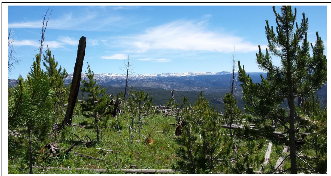
Left: Whitebark pine ( Pinus albicaulis ) and lodgepole pine ( Pinus contorta ) regenerating at Henderson Mountain after the 1988 Yellowstone Fires.