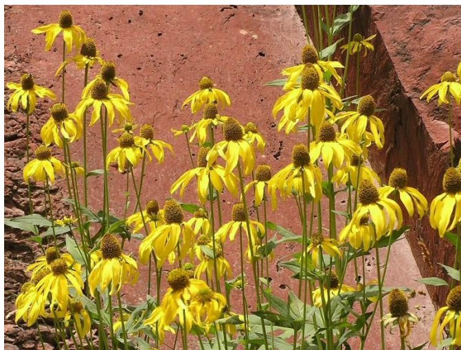
Rudbeckia laciniata , Ouray County, Colorado

Rudbeckia laciniata , Goldenglow, is a perennial to 7 feet tall. The leaves are usually toothed or lobed, to 6 inches long and 4 inches wide. The flowers are in the typical Composite head with yellow reflexed ray flowers surrounding a cluster of yellowish disk flowers which form a short cone. The heads are to 5 inches across at the tips of the stems. They appear from July to September. The plants occur naturally in moist, open or partly shaded areas in the plains, basins, valleys, and foothills. They prefer full sun or partial shade and moist to wet soils. They can be grown from seed. Cold stratification for 30 days will help germination of stored seed. The plants may not bloom until their second year. They can also be transplanted easily.