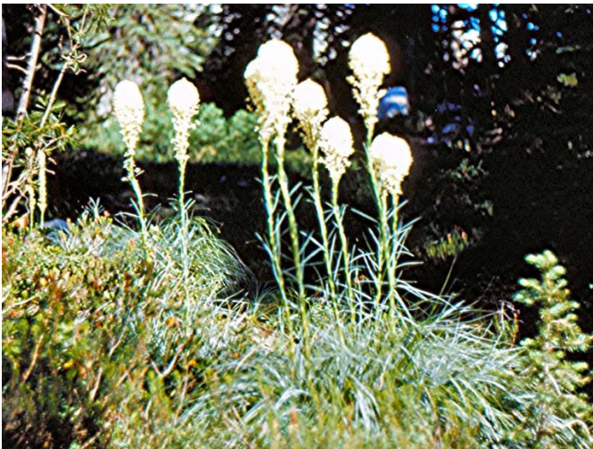
Xerophyllum tenax , Ravalli County, Montana

Xerophyllum tenax , Beargrass, is a perennial forming a large clump to 3 feet wide with stems to 4.5 feet tall. The leaves are mostly basal, very narrow and grass-like, rigid, and to 2 feet long. The flowers are white to cream, each to 0.5 inch across, but borne in a dense club-shaped cluster to 20 inches long and 4 inches across at the tips of the stems. They appear from May to August depending on elevation. The plants occur naturally in open woods and on slopes in the mountains. They prefer full sun to partial shade and dry to moist, loamy, well drained soils in cooler areas. It does not bloom consistently every year. The plants can be grown from seed that has been cold stratified for 90 days or more, or sow outdoors in the fall. Rootstocks can be divided in the fall. Seed is commercially available.