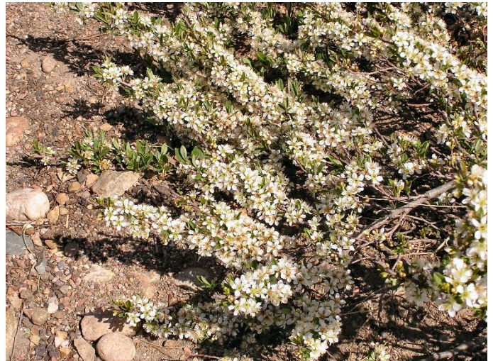
Prunus pumila var. besseyi , Larimer Co., Colorado Cultivated

To see the above plants in color, go to the newsletter on the Society website.