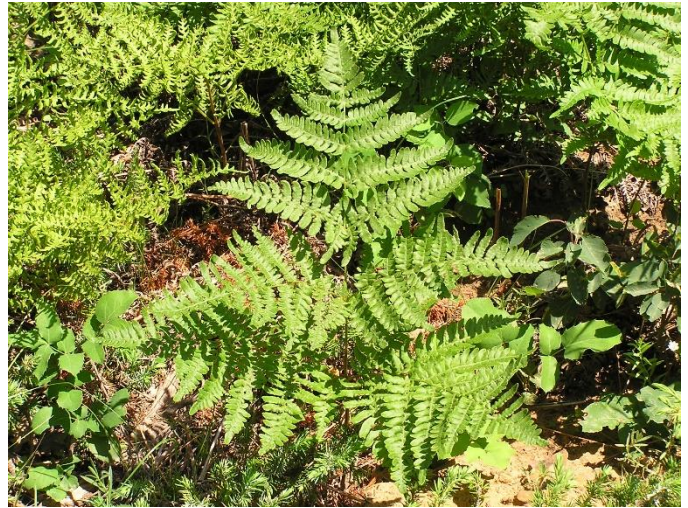
Pteridium aquilinum , Crook County

Pteridium aquilinum , Bracken Fern, is a perennial fern to 6 feet tall. It spreads by creeping rhizomes and can be aggressive forming large colonies. The leaves are triangular in outline, to 6 feet long with the blade and petiole each about half the total length. The young leaves are poisonous. The plants occur naturally in open woods and other openings in the mountains. They tolerate full sun to shade and prefer moist, well drained soils but are drought tolerant. They spread readily so will need to be controlled regularly. They are easily grown from rhizome cuttings and are in the nursery trade.