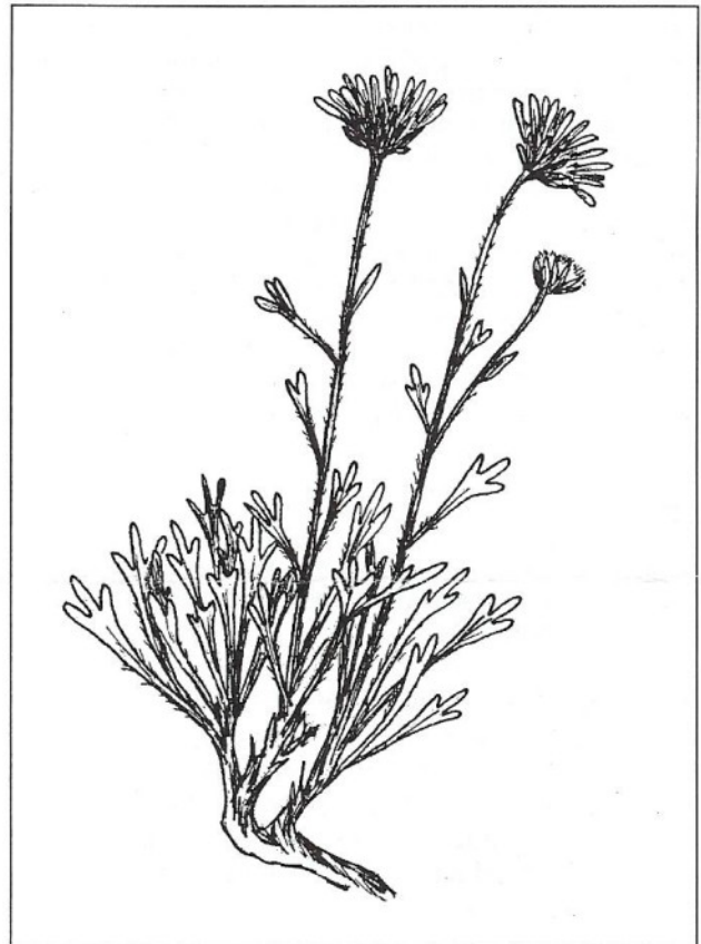
Above: Bighorn fleabane ( Erigeron allocotus ) Illustration by Walter Fertig

Bighorn Canyon NRA was established in 1966 to promote recreational opportunities on the soon-to-be created Yellowtail Reservoir and to protect historical sites including the Mason-Lovell Ranch and Bad Pass Trail. As a unit of the National Park Service, Bighorn Canyon is also managed to conserve the common and rare native plants and animals. The first systematic inventory of the Bighorn Canyon NRA flora documented 656 vascular plant taxa (Lichvar et al. 1985), reflecting its diversity of habitats. [continued on page 7]