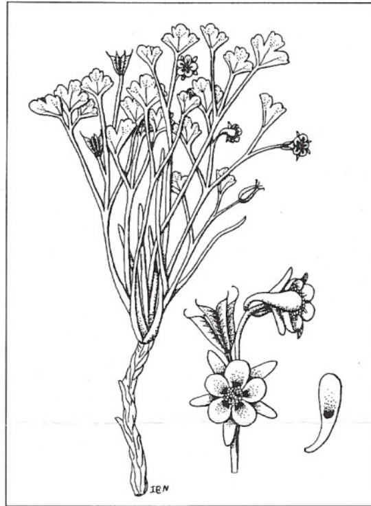
Above: Aquilegia laramiensis Illustration by Isobel Nichols

North America. It appears that the white, pendant, short-spurred flowers are a unique combination of floral traits, suggesting either a new pollination syndrome or a self-pollinating derivative of A. saximontana . On the other hand, the mat-habit and deep seed dormancy of A. jonesii are novel columbine adaptations to the harsh alpine conditions. I am currently conducting a seed germination study to test this hypothesis.