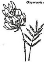
Oxytropis nana Nutt., a Wyoming endemic collected by Thomas Nuttall on his journey across Wyoming in 1834