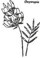
Oxytropis nana Nutt., a Wyoming endemic collected by Thomas Nuttall on his journey across Wyoming in 1834