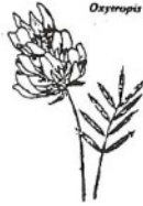
Oxytropis nana Nutt., a Wyoming endemic collected by Thomas Nuttall on his journey across Wyoming in 1834