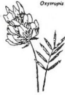
Oxytropis nana Nutt., a Wyoming endemic collected by Thomas Nuttall on his journey across Wyoming in 1834