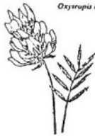
Oxytropis nana Nutt., a Wyoming endemic collected by Thomas Nuttall on his journey across Wyoming in 1834